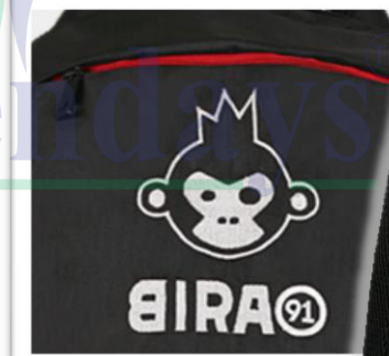
Logo embroidered on backpack