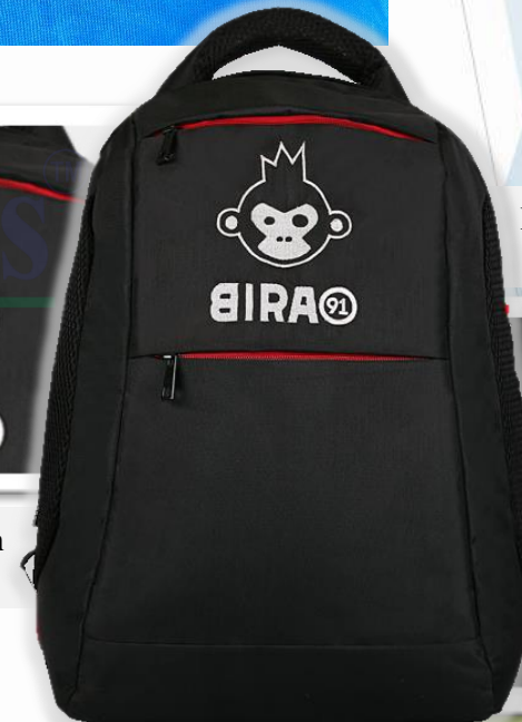
Backpack strap with embroidered logo