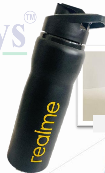
Print on water bottle